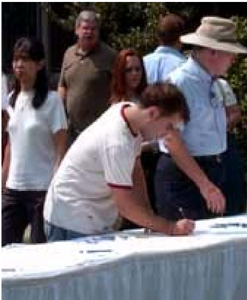
Freshmen at Duke University signing the Community Standard